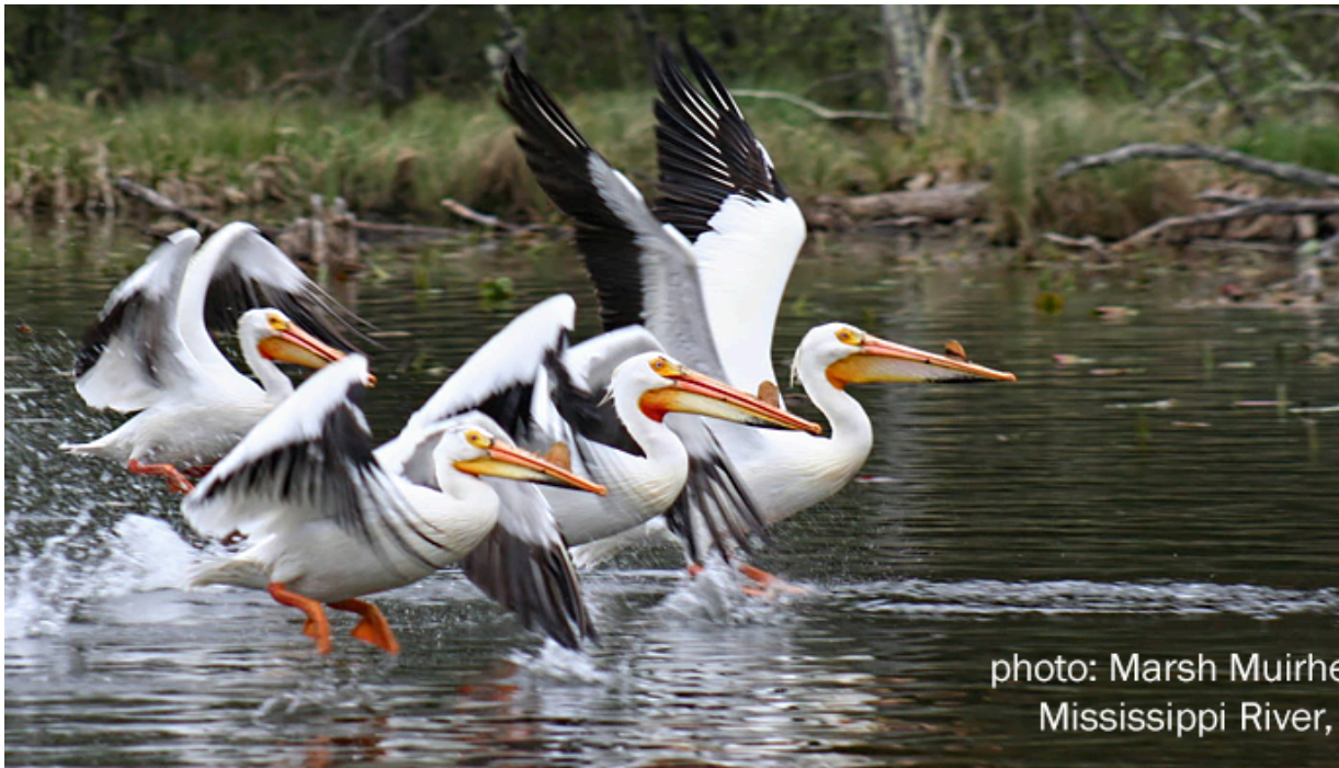
Mississippi River