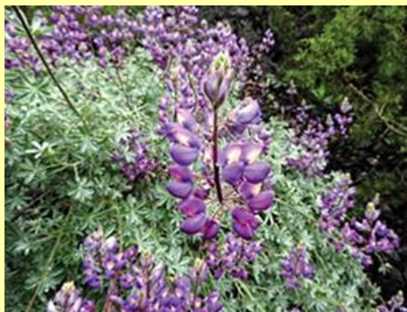
Silver Bush Lupine ( Lupinus albifrons )

Five different species of trillium were in bloom in a variety of places in the Garden. This one is native to the Garden.