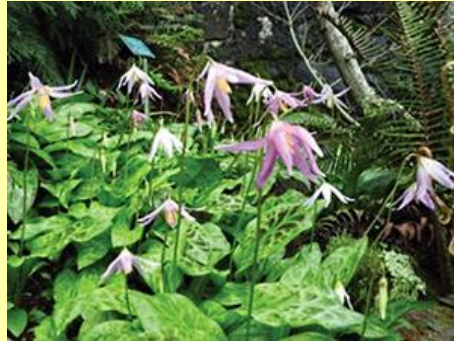
Coast Fawn Lily ( Erythronium revolutum )

Mottled leaves reminiscent of the markings of a fawn. There were four different species of fawn lilies in the Garden in bloom on 03/12/2016.