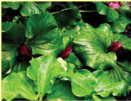
Wake Robin ( Trillium chloropetalum )

Many different currants blooming throughout the Garden. This one was growing at the edge of Wildcat Creek, which was flowing vigorously.