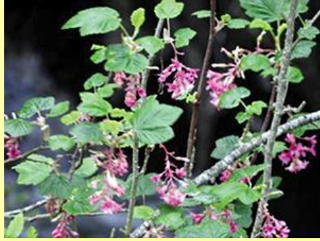
Flowering currant ( Ribes sanguineum )

Many different currants blooming throughout the Garden. This one was growing at the edge of Wildcat Creek, which was flowing vigorously.