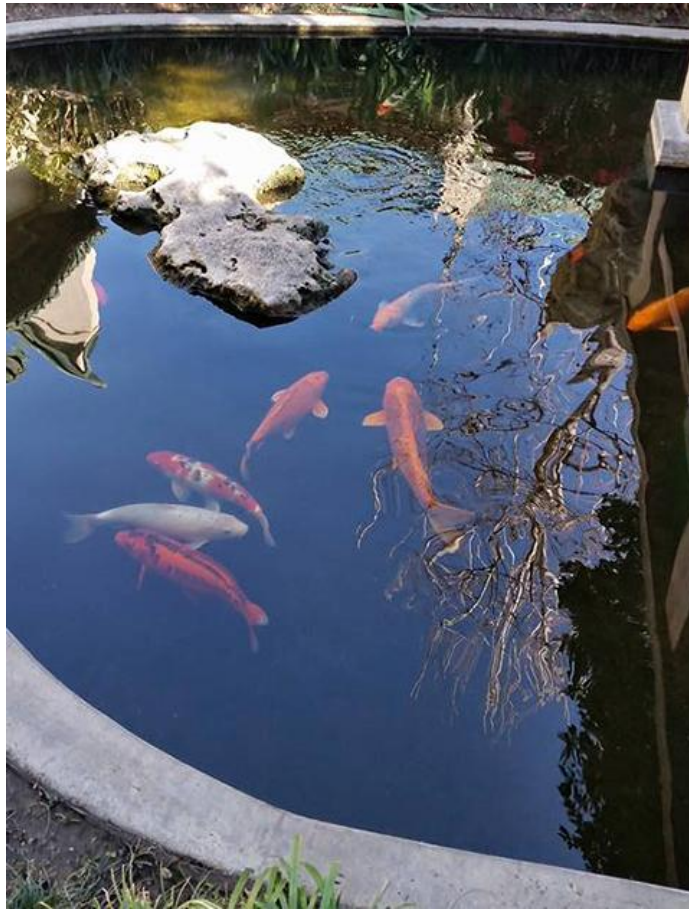
Koi courtyard of the USC Pacific Asia Museum, where the SCHSG meets and the HSA Regional Meeting will take place