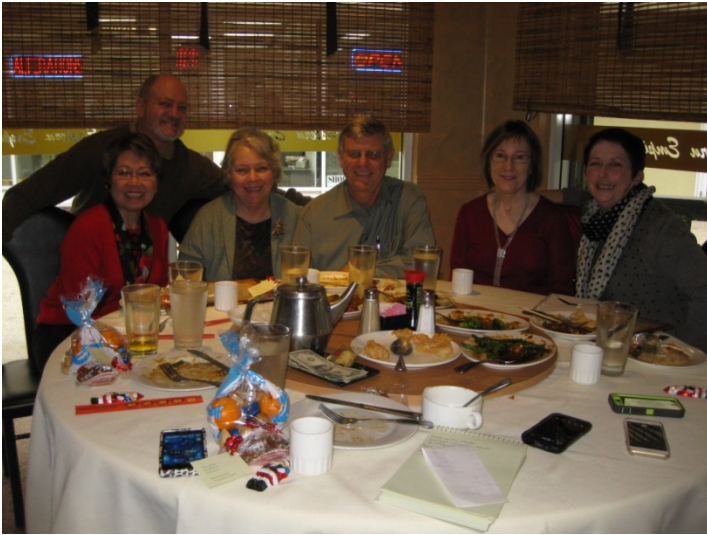
CVHC Christmas Gathering, December 2014

After sharing recent haiku, and before leaving, the date of Saturday, February 28 th , 2015, was set for the first meeting of the New Year. It will be held again at the Eastern Empire Bar & Grill (460 Howe Ave., Sacramento, CA 95825).