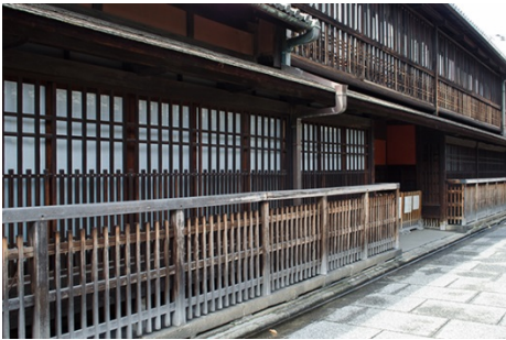
Sumiya pleasure quarters