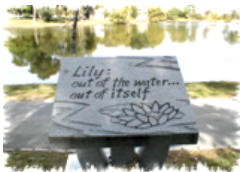
Nick Virgilio Haiku Association