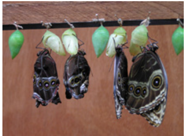
Costa Rica.