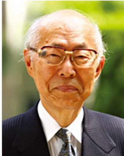
Dr. Akito Arima

Dr. Arima has also been instrumental in promoting the internationalization of haiku. He has served as the president of the Haiku International Association and has helped organize international haiku events, including the second joint conference of Japan's Haiku International Association and the Haiku Society of America in Tokyo in 1997.