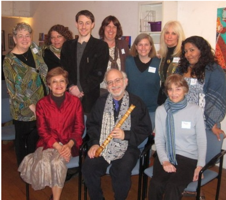
Presenters and Co-chairs at the 1st Quarterly HSA meeting in San Diego