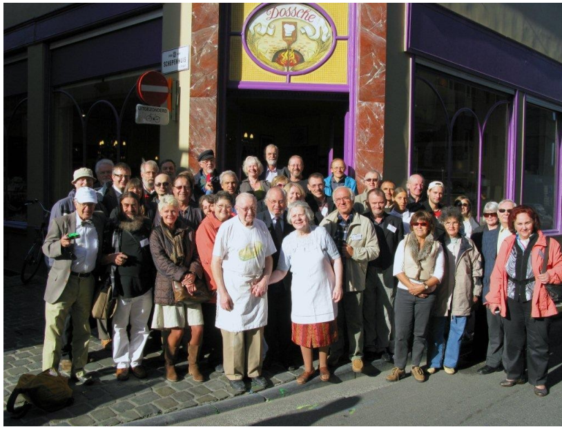
Participants at the Haiku in Ghent International Haiku Conference in Ghent, Belgium on September 16, 2010

months on Daily Haiku . In the spring she is scheduled to lead a 6-week course on haiku for the Osher Lifelong Learning Institute at the University of Alabama in Huntsville.