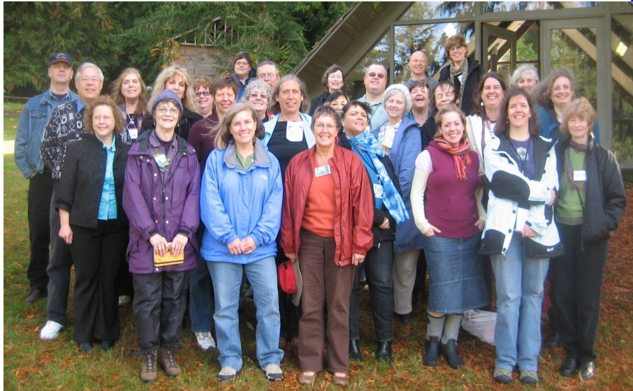
2009 Seabeck Haiku Getaway Attendees